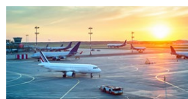
Airline, Hull and Liability