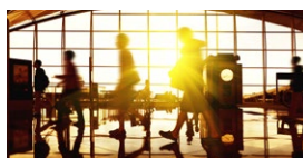
Airport Owners and Operators