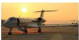
General Aviation, Hull and Liability

AIG addresses Multinational Aerospace clients' complex coverage needs through deep industry experience and the ability to deliver creative, flexible solutions. We provide a full suite of Aerospace products and offer bespoke Multinational insurance solutions for the following operations.